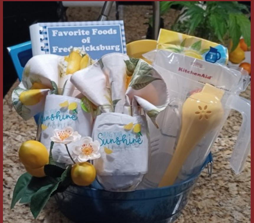
Baskets for sale at the ZCF table during the D10 Conference!