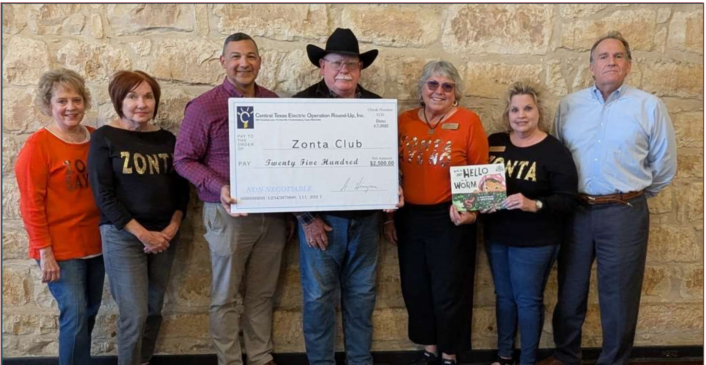
On April 7, the Central Texas Electric Cooperative presented a generous check for $2500 from Operation Round-Up to ZCF for the Dolly Parton Imagination Library!!! WOW!! Thank you CTEC!!