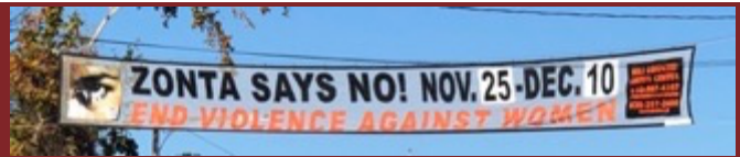
Banner over Main Street