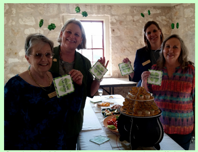
Our lovely March hostesses showing off their St. Patrick's Day paraphenelia and their pot of gold appetizers at the Tatsch House.

Their private drive will take you directly to her home; please be kind when parking to allow for the most availability for all. We will have our Election of Officers this evening and a presentation from the Ways and Means committee. See you then!