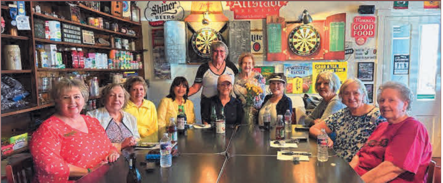
ZCF Celebrates March 8 and Rose Day at The Pecan Grove.