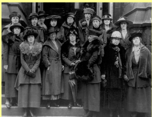
Their vision became Zonta International, an organization that has grown to more than 29,000 members in 63 countries.

June 1919 was a milestone month for women's history in the United States. After decades of petitions, silent vigils, hunger strikes and protests, in June 1919, the U.S. Senate passed the 19th Amendment, guaranteeing all American women the right to vote. The amendment would not be fully ratified until 18 August 1920; however, its passage was a victory for women suffragists who had fought tirelessly to be given an equal voice and to be fully recognized as American citizens.