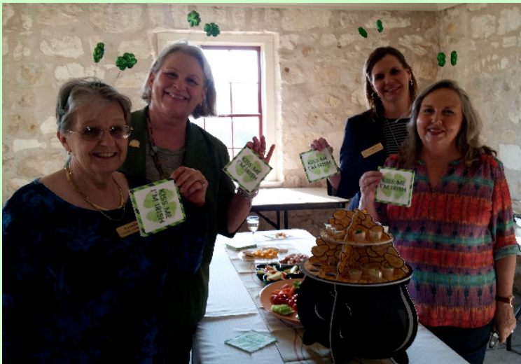
Our lovely March 2017 hostesses showing off their St. Patrick's Day paraphenelia and their pot of gold appetizers at the Tatsch House.